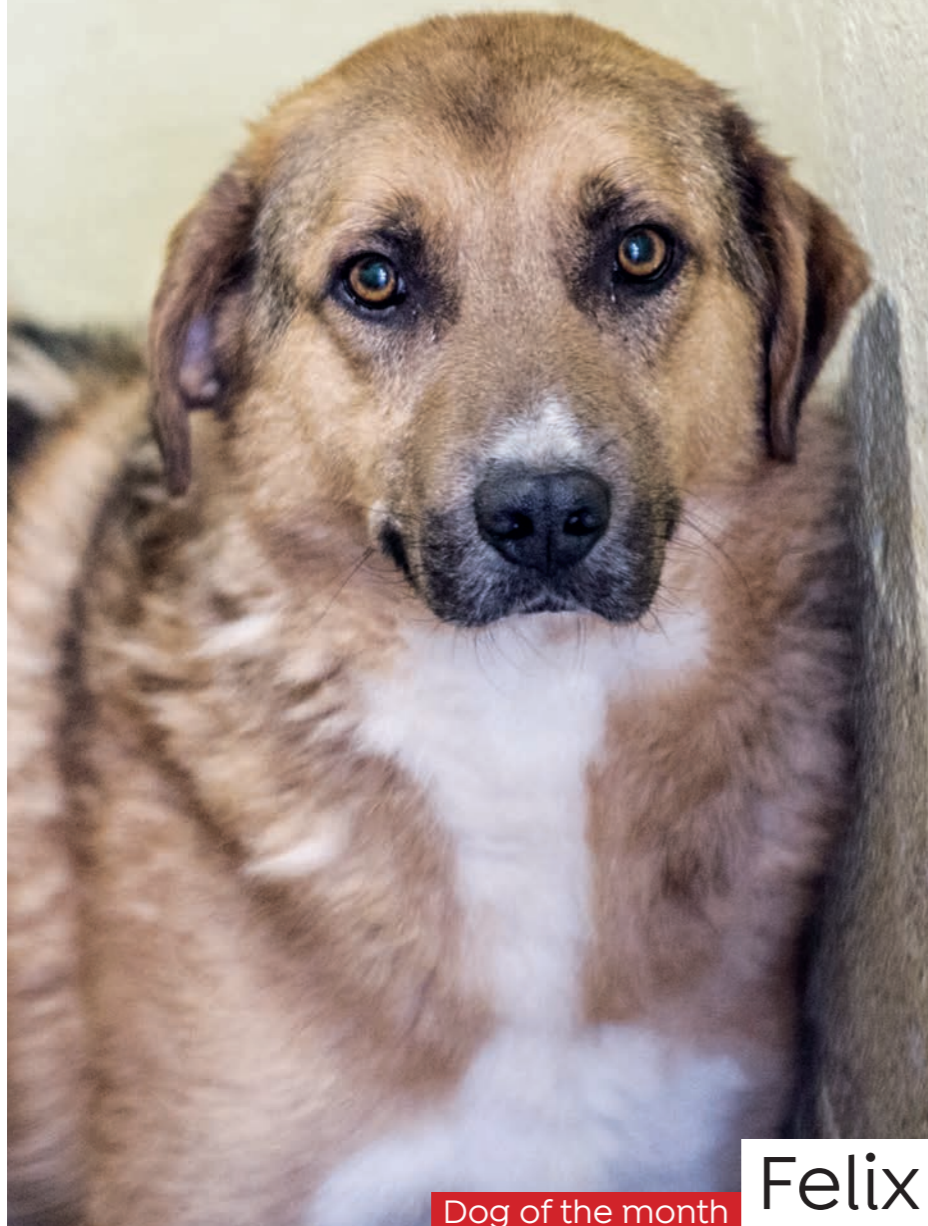
Dog of the month